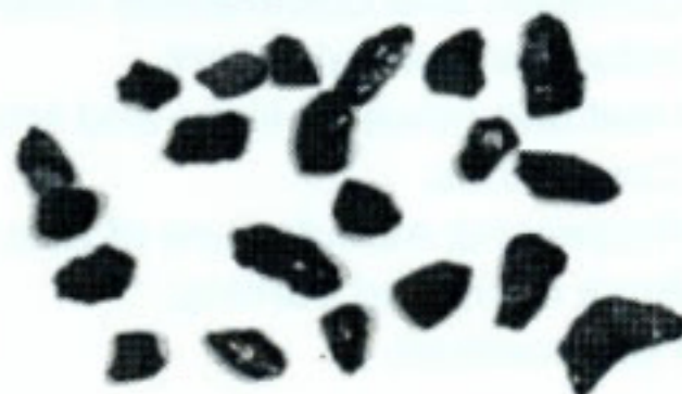
RICE - \frac{5}{16} \times \frac{3}{16}