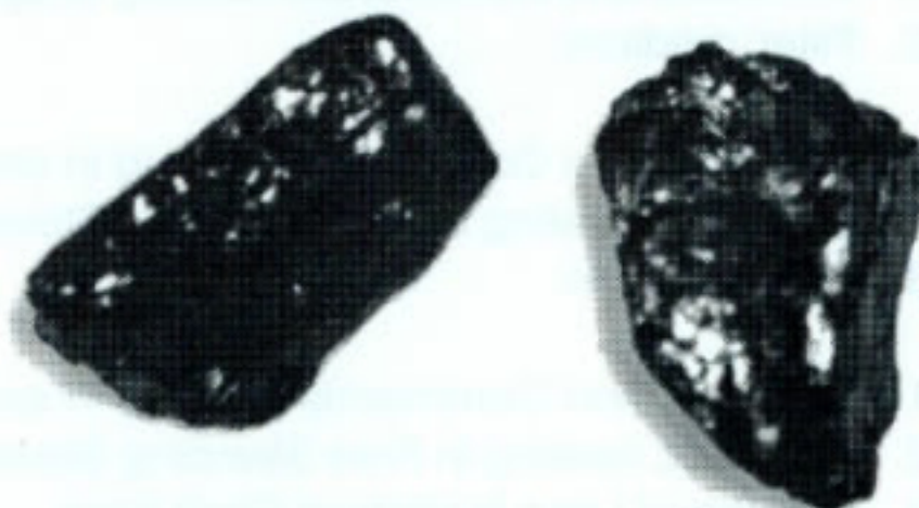
CHESTNUT - 1 \frac{5}{8} \times \frac{13}{16}