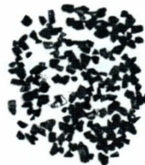
BARLEY - \frac{3}{16} \times \frac{3}{32}