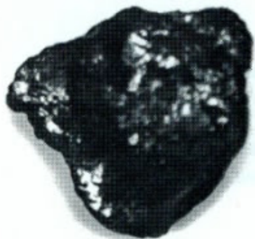
STOVE - 2 \frac{7}{16} \times 1 \frac{5}{8}