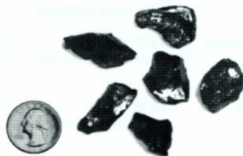
PEA - \frac{13}{16} \times \frac{9}{16}